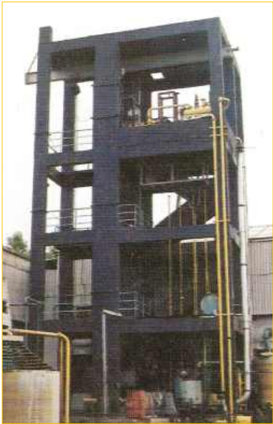
Ejector System with Intermidate Condenser